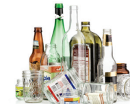
Glass Bottles & Containers