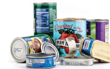
Food & Beverage Cans