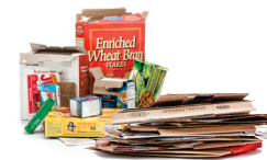
Flattened Cardboard & Paperboard