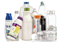
Plastic Bottles & Containers