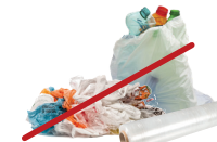
NO Loose Plastic Bags, Bagged Recyclables or Film Empty recyclables directly into your cart